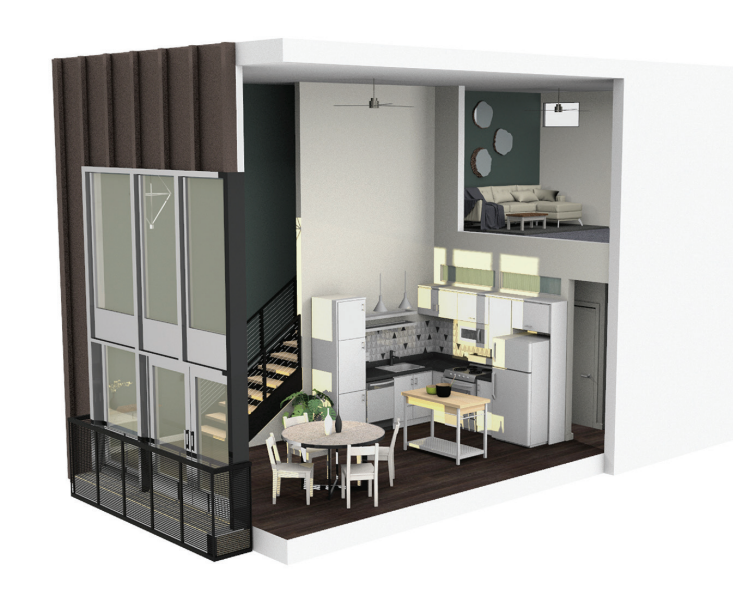
Unit 2 Loft