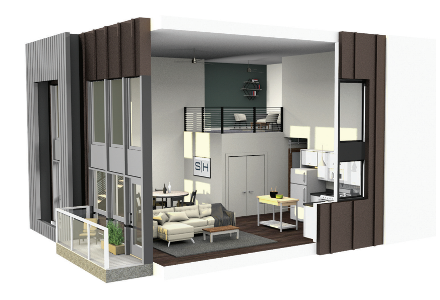
Unit 4 Loft