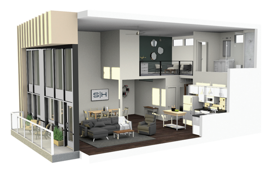
Unit 3 Loft