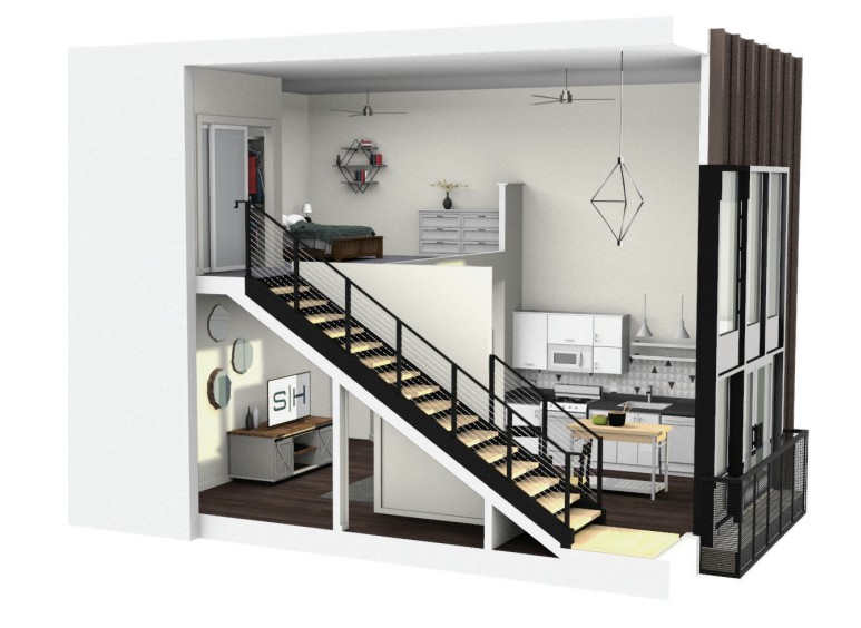
Unit 1 Loft